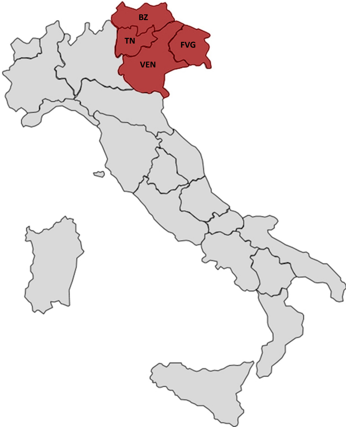
Figure 3: Regions in northeastern Italy reporting TBE cases (BZ=Autonomous Province of Bolzano; TN=Autonomous Province of Trento; [BZ+TN=Trentino-Alto Adige] VEN= Veneto; FVG= Friuli-Venezia Giulia).