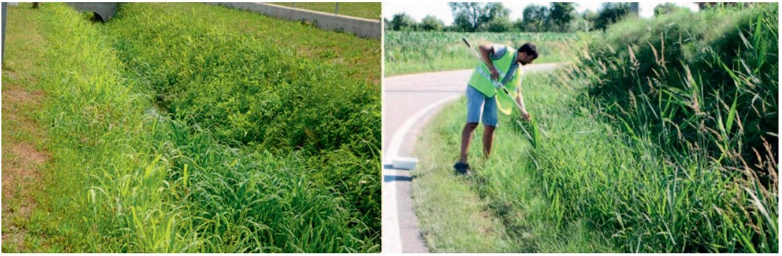
Fig. 1. Left: A typical rural ditch hosting mosquito larvae and pupae in Padua Province (Italy). Right: Collector sampling for mosquito immature stages using dipper.

documented in mosquito populations even after long and widespread field applications (Becker 1997, Regis and Nielsen-LeRoux 2000). In contrast, B. sphaericus (hereafter Bs ) is utilized predominantly in organically rich habitats and has been shown to have longer residual activity and higher tolerance to organic pollution (Mulla et al. 1999) than Bti (Lacey 2007). However, Bs is effective against a narrower range of mosquito species than Bti , and a potential for resistance development has been observed in the Cx. pipiens complex (Rao et al. 1995, Yuan et al. 2000).