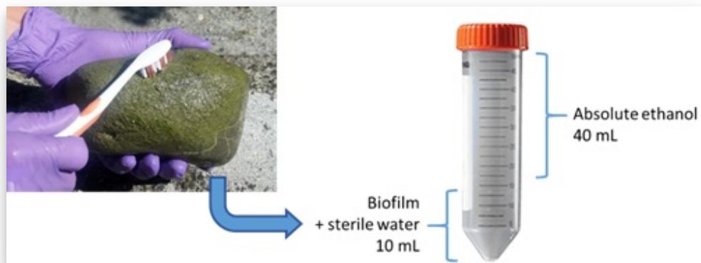
Figure 1: Schematic sampling procedure in the field when stones are available