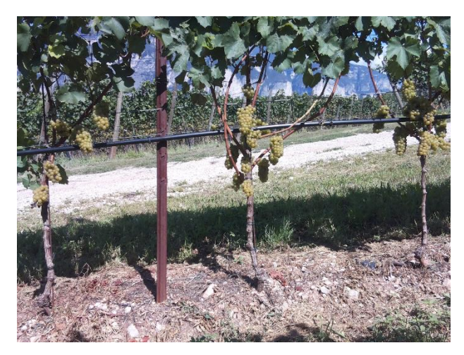
Fig. 6. Image taken by the camera inside the vineyard (Fig. 4).