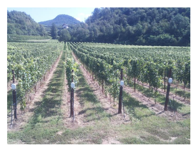
Fig. 5. Overview of the vineyard from the main station (Fig. 3).