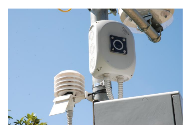
Fig. 3. Main phenological station, mounted on the pole of the general electrical panel. On the left, the AM2315 digital air temperature and humidity sensor is hosted in a 3D-printed radiation shield, which supports also the capacitive leaf wetness sensor.

A minimal setup has been mounted in a WP11-15-4G enclosure (Takachi Electronics Enclosure Co. Ltd., Kawaguchi-shi, Saitama, Japan) and installed begin of July on a vineyard pole, facing to opposite row (Fig. 4). In this case, the field of view is limited to 3 vines (about 2.5 m), but the images are very detailed (Fig. 6).