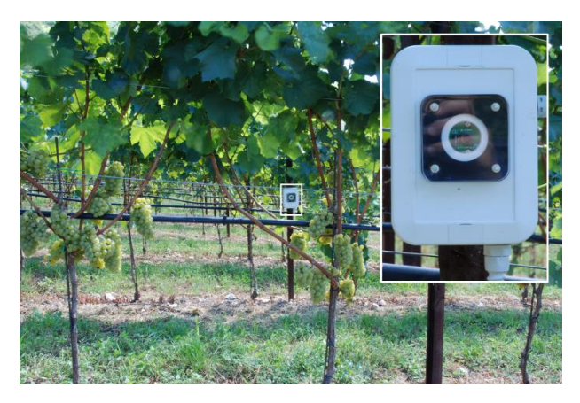
Fig. 4. Mini phenological camera, mounted on a vineyard pole. No sensors are available to reduce as much as possible the dimensions and the encumbrance.

Each Raspberry Pi zero W computer board is registered into an OpenVPN private network to ensure the connection to the server (Linux-Ubuntu) for file transfer, as well as, the remote access over a secure connection (SSH), which, in turn, allows changes in the ON/OFF scheduling script or uploading a new sketch (sequence of commands) into Arduino, and, finally, to upgrade the operating system (Raspbian) of the Raspberry Pi zero W single board computer.