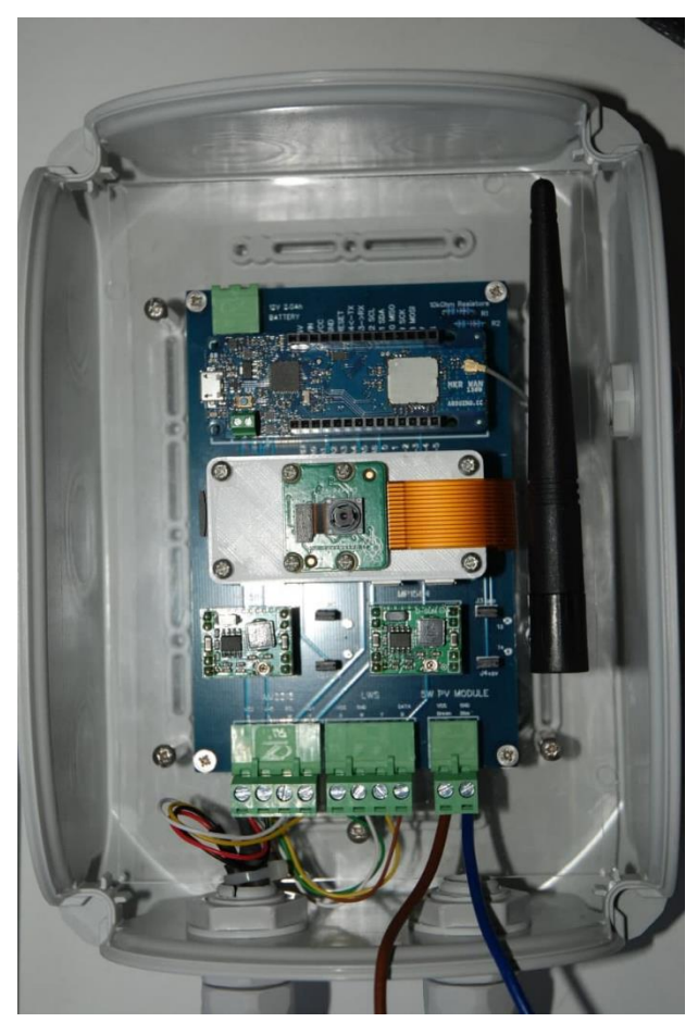
Fig. 1. Fully assembled Printed Circuit Board "Raspberrino". The PCB hosts the microcontroller Arduino MKR WAN 1300, the single board computer Raspberry Pi zero W + Camera module V2 on the Witty Pi 3 mini clock and power management board, 2 voltage regulators, and, finally, the terminal blocks, for a fast connection of the sensors, low voltage input and 12V battery output.

All the components have been enclosed in a waterproof plastic box KF 1600 G (Gustav Hensel GmbH & Co. KG Lennestadt, Germany; Fig. 1).