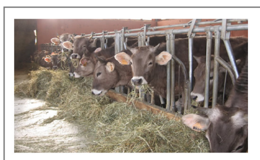
You are about to taste a cheese made from the milk of cows kept in a valley floor stall