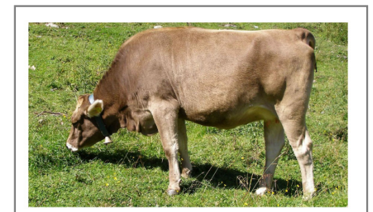
You are about to taste a cheese made from the milk of cows grazed in a mountain hut

The test consisted of an experiment that was evaluated in 'informed' conditions, combining conjoint analysis with the tasting of the two Puzzone di Moena PDO cheeses (described in Section 2.1). Each consumer received four cheese samples in total, according to a complete factorial design with two milk productions and two information levels. The two cheeses (P and S) were presented twice, each time with different external information: 'Produced from milk of cows reared on mountain pasture' (Claim_P) or 'Produced from milk of cows reared in valley floor stalls' (Claim_S). These two claims were submitted to consumers on the computer screen (Figure 1), just before tasting the sample. Consumers rated their overall liking of the four cheeses on a nine-point scale, from 1 = "Dislike extremely" to 9 = "Like extremely". The four samples were presented in a random and balanced order for each participant, who evaluated them under white light.