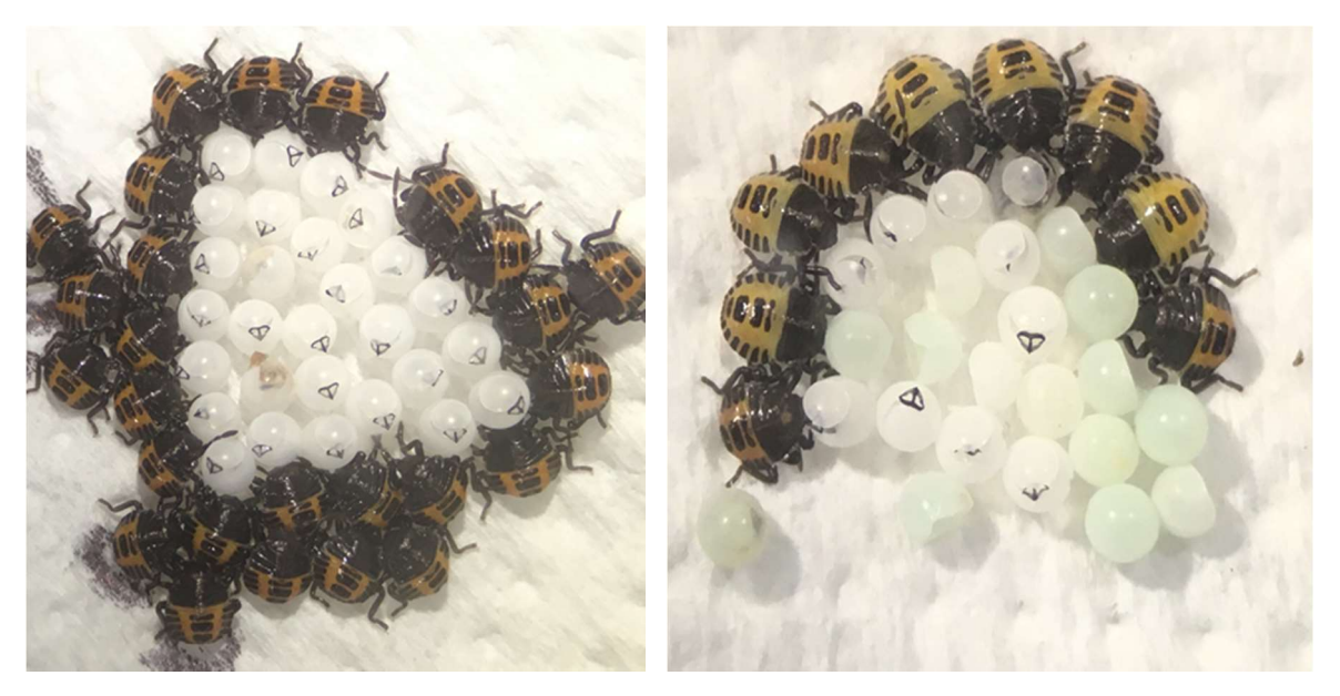
(A) Progeny from non-irradiated males

Eggs of Halyomorpha halys were obtained from crosses between non-irradiated males and virgin females, and crosses between virgin females and males irradiated at 16 Gy (Figure 1).