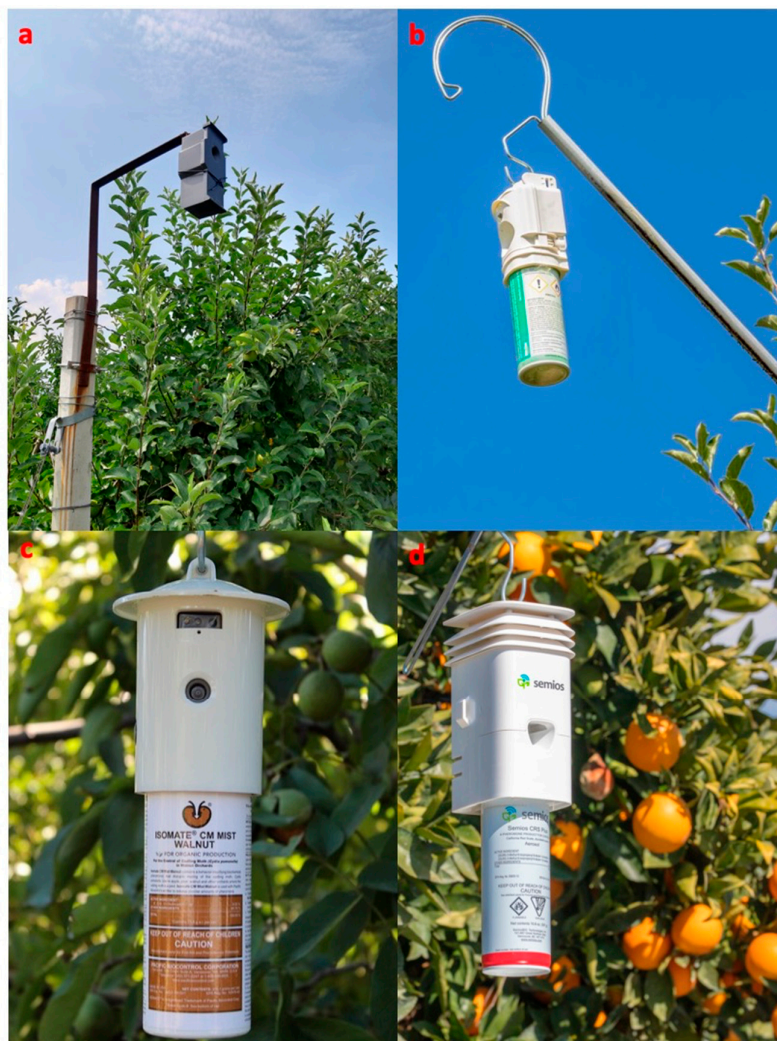
Figure 1. Examples of aerosol devices currently marketed (2018) for pheromone-mediated mating disruption of the codling moth, Cydia pomonella , in apple orchards, (a) CHECKMATE Puffer® CM (Suterra), (b) ISOMATE® CM MISTER (CBC Europe Srl-Italy), (c) and in walnut orchards, ISOMATE® CM MIST WALNUT. (d) Management of Aonidiella aurantii in orange groves relying to Semios CRS Plus (Semios Technologies Inc. Canada).

The first references to the use of aerosol-based MD to control moth pests of fruit trees were reported by Shorey and coworkers [25–27]. Successful area-wide MD programs using Puffer® devices to manage C. pomonella in pome fruits were in California during the period 1995–2002 [33]. In California, until then, most of the MD devices deployed were passive dispensers (Isomate C+ rope dispensers and Checkmate CM laminate ones). During this early research, Puffer® devices were successfully used on more than 520 ha of pears in Lake County [5]. The amount of pheromone in aerosol formulations was based upon the amount of pheromone contained in high-density passive dispensers deployed at 1000 units ha -1 [53].