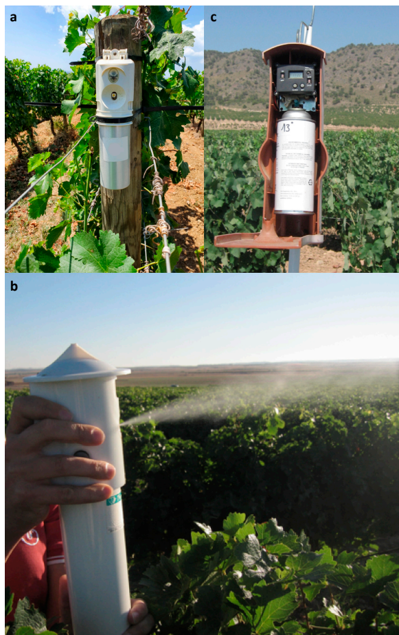
Figure 3. Aerosol devices used for pheromone-mediated mating disruption of the European grapevine moth, Lobesia botrana , on grapevine: (a) Isonet® MISTER PRO L, (b) Isonet® MISTER releasing a puff of L. botrana pheromone in a Spanish vineyard, (c) CheckMate® Puffer® LB (Suterra).

Lucchi et al. [42] evaluated the efficacy of an aerosol device, Isonet® MISTER PRO L (Figure 3) releasing the main L. botrana pheromone component (i.e., (7E,9Z)-7,9-dodecadien-1-yl acetate) at selected time intervals. These authors compared the efficacy of Isonet® MISTER PRO L at the density at two units·ha -1 over two years in the Aragon region of Spain, with respect to the suppression of L. botrana catches, as well as larval infestation on bunches, to the MD product Isonet® L and a grower's standard. The deployment of Isonet® MISTER PRO L significantly decreased male catches in MD plots over control ones. The number of infested bunches and nests per bunch was lower in MD plots compared to the grower's standard. Isonet® MISTER PRO L achieved comparable efficacy to the standard MD product Isonet® L [42]. Recently, video camera-assisted pheromone traps were deployed to continuously monitor the flight of L. botrana over the course of a day [69]. Since most of the L. botrana flight occurred between dusk and midnight, the potential of finely tuning the time intervals of pheromone release, by concentrating aerosol releases during this period, is relevant and worthy of further research [69].