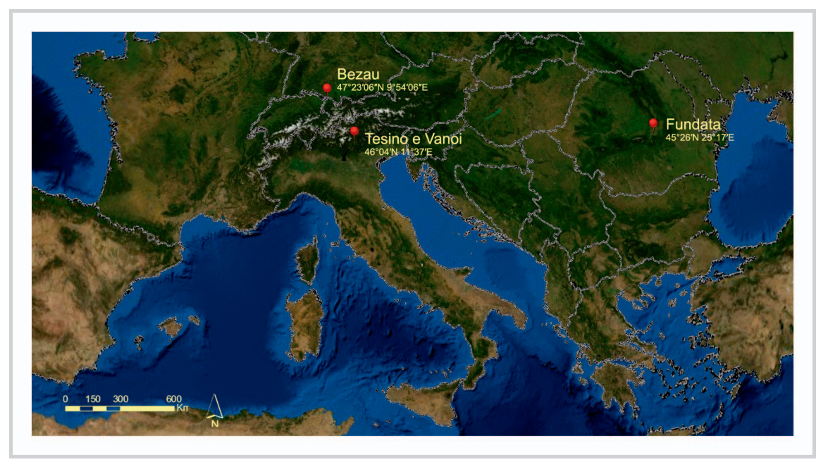
FIGURE 1 Location of the 3 case studies. (Map by Alberto Di Gioia, DISLIVELLI)

welcoming and inclusion processes in regions with a net population gain from immigration in Austria, Italy, and Romania (Figure 1). The different national contexts and the diverse forms of immigration occurring in the 3 locations provided a wealth of information on the potential of such processes in different settings. The focus of our analysis was on new ideas and initiatives with the potential to promote positive social change in mountain environments. Our findings suggest that 3 key factors in the success of welcoming and inclusion processes in these sparsely populated mountain regions have been (1) the presence of a supportive social environment that enables the development of relationships between newcomers and long-time residents, (2) the presence of local brokers who are able to bridge the gaps between different social and ethnic groups, and (3) appropriate locations in which new arrivals may settle down and find support.