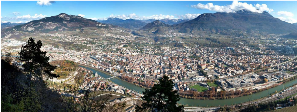
Figure 2. Aerial view of the city of Trento