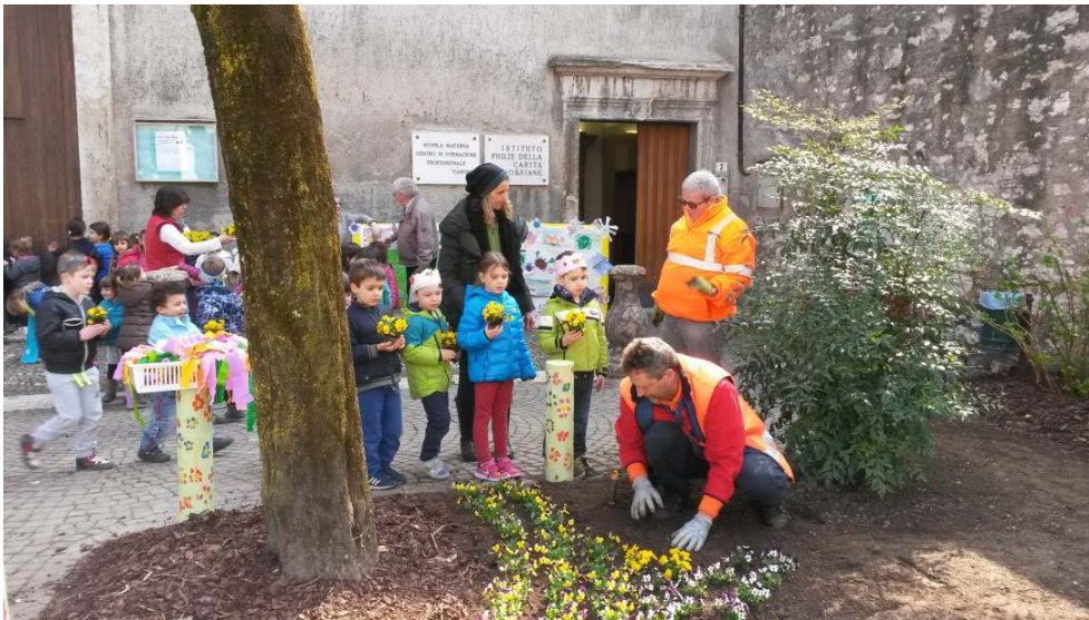
Figure 3. Flower Garden management with school's pupils