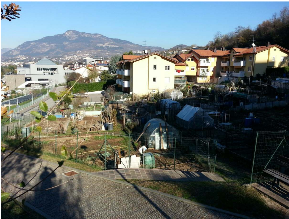
Figure 4. Public vegetable gardens in the suburb of Villazzano