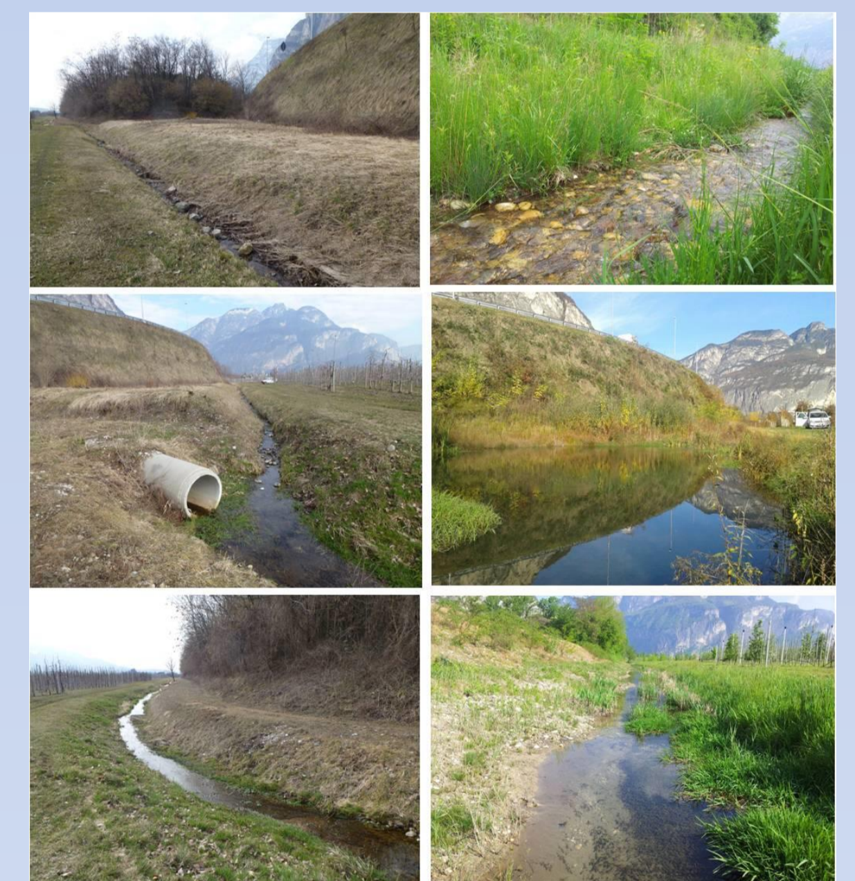
Fig. 3. Restoration of habitat for A. pallipes in the Piana Rotaliana (Trentino, LIFE +T.E.N. Action C10). Left: before restoration (2013), right: after restoration (2015).

3) Prevention and mitigation of threats: