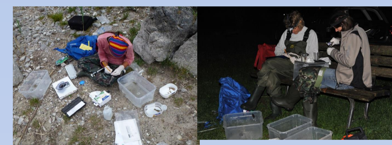
Fig. 2. Monitoring of populations of A. pallipes (2012-2014). Left: collection of biometric data; right: collection of samples for biomolecular characterization.