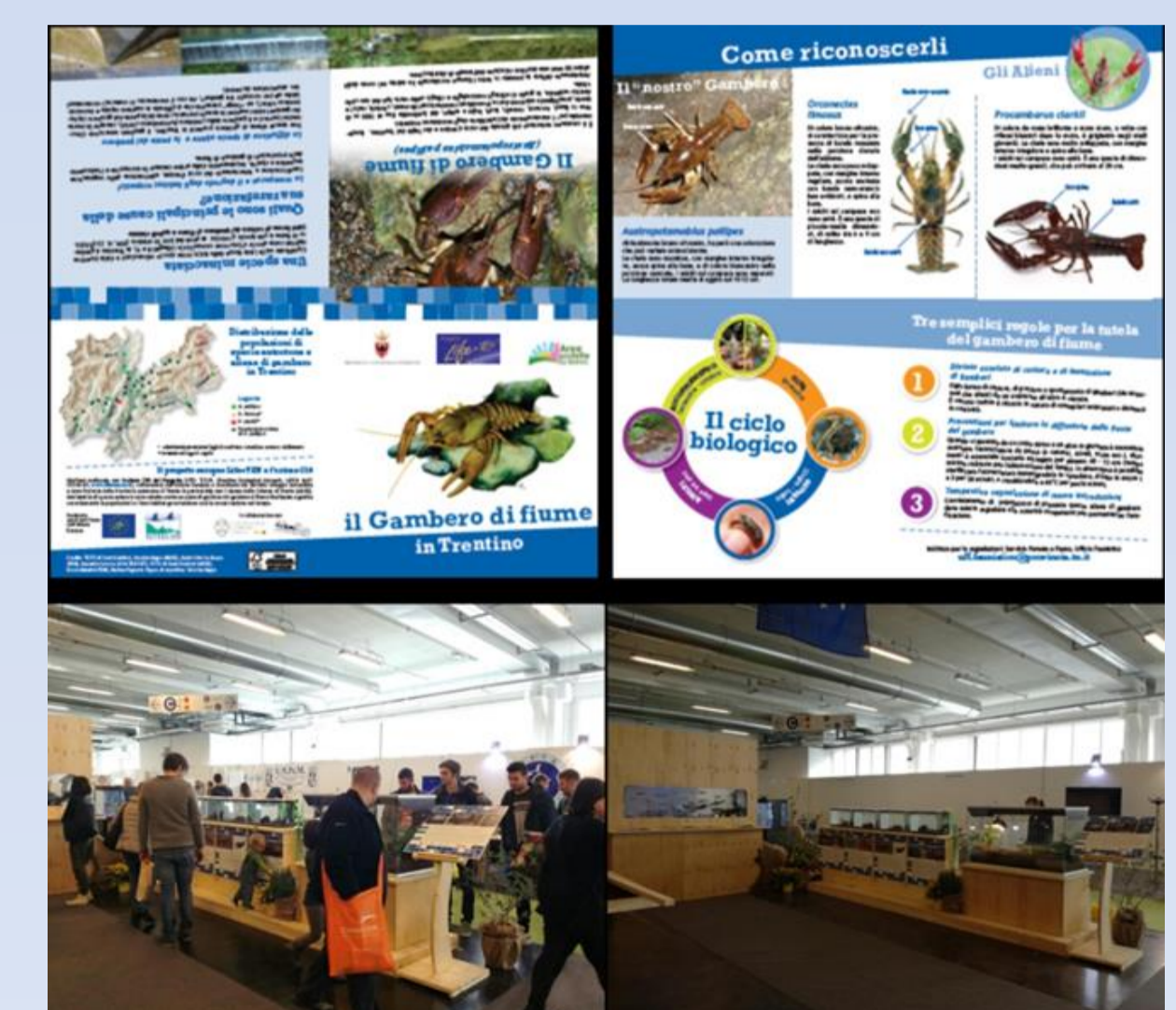
Fig. 5. Crayfish informative brochure and display at the exhibit «Expo Caccia, Pesca e Ambiente 2017, Riva del Garda (TN)» 25-26 March 2017.