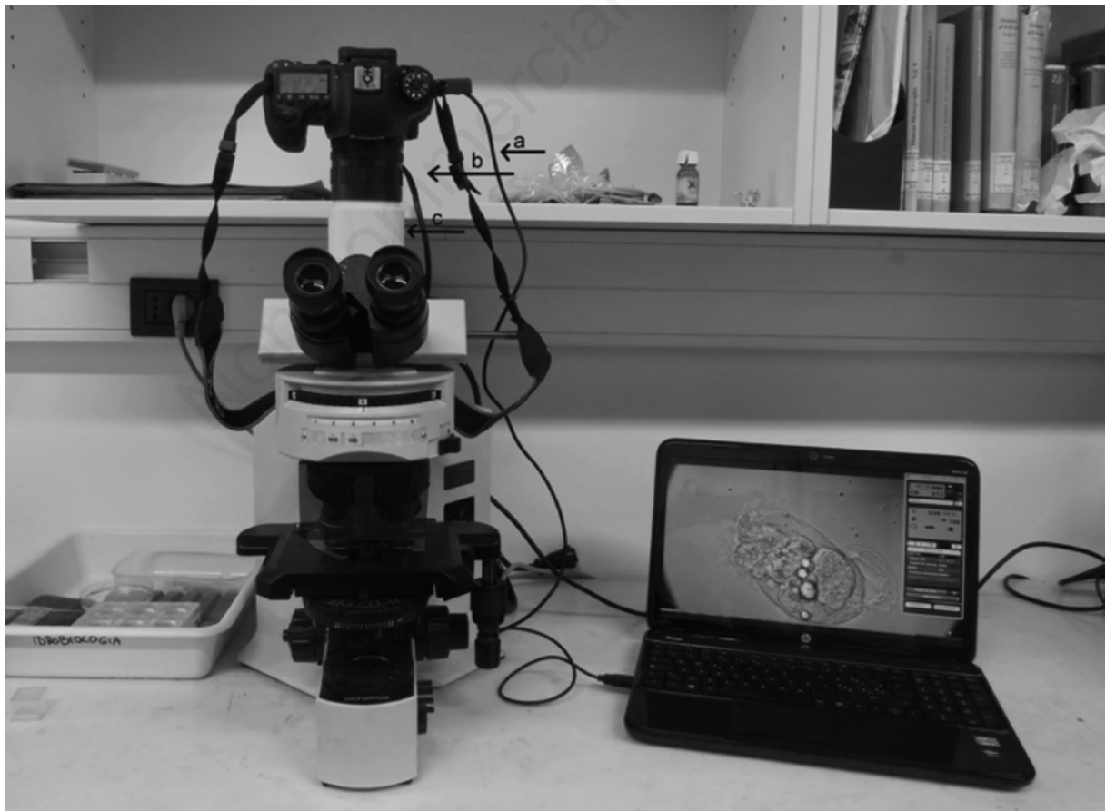
Fig. 1. Microscope with attached DSLR camera connected to the computer via USB cable (a) for live-preview filming; please note that the camera's objective lens was removed and that the camera was connected by an extension tube (b) to the microscope. A plastic adaptor (c) held the extension tube in place.

Males of B. angularis and K. cochlearis , respectively, were placed together with conspecific females using a