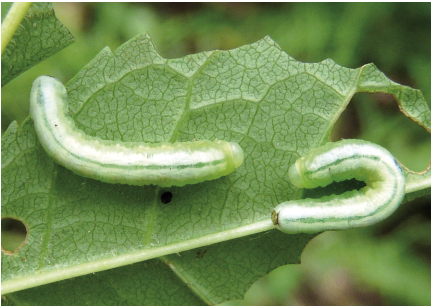
Figure 1: Larvae of Tomostethus nigritus (Hym. Tenthredinidae) on common ash.