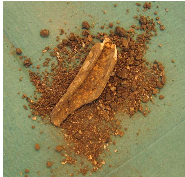
Figure 1. Tibia fragment of the Paglicci 23 specimen. DNA was extracted from this fragment and from skull splinters, and all extracts yielded the same HVR I sequence. doi:10.1371/journal.pone.0002700.g001

The degree of racemization of three amino acids, aspartic acid, alanine, and leucine, provides indirect evidence as for the presence in an ancient sample of amplifiable DNA. In particular, DNA is