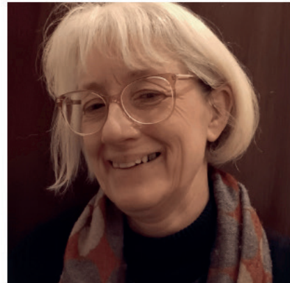
Penny A. Gowland Sir Peter Mansfield Imaging Centre - United Kingdom