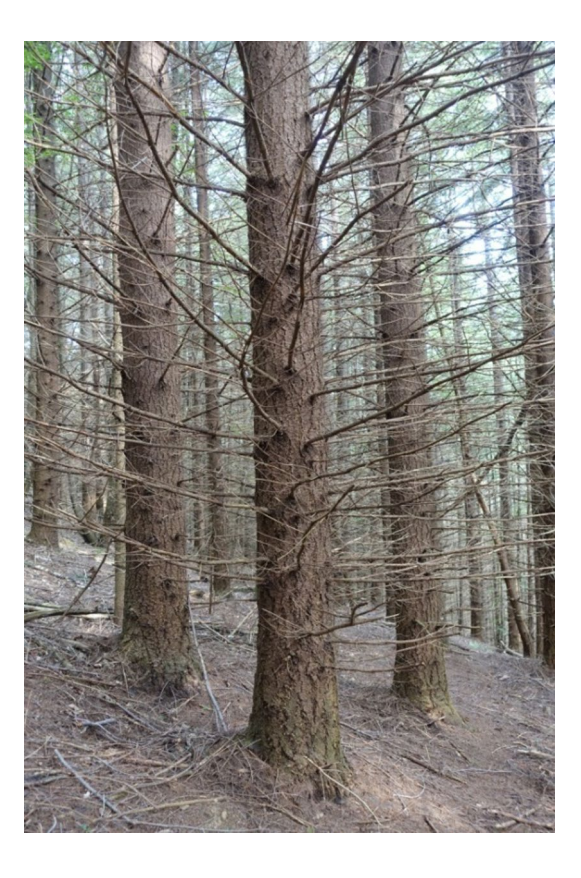
Fig. 2 Slow natural pruning of 50-year-old Douglas-fir in Slovenia

The main characteristics of successful pruning operations include only pruning the final crop trees where the production of high quality wood assortments is the goal (Marcu and Liubimirescu 1979). Depending on the country and