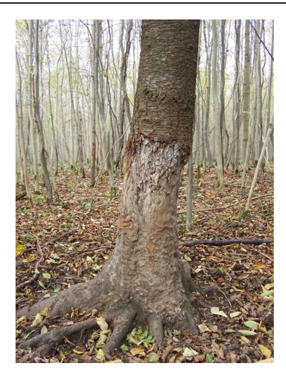
Fig. 1 Wild boar damage on Douglas-fir

Bastien 2019). All Douglas-fir provenances recommended for Europe are of the coastal variety and originate from the part of its native range between 40° and 50° N latitude, west of the Cascade Range and below 600 m altitude, e.g., northern Oregon and western Washington states in the USA as well as the Vancouver region in British Columbia, Canada (Isaac-Renton et al. 2014; Chakraborty et al. 2015; Konnert and Bastien 2019).