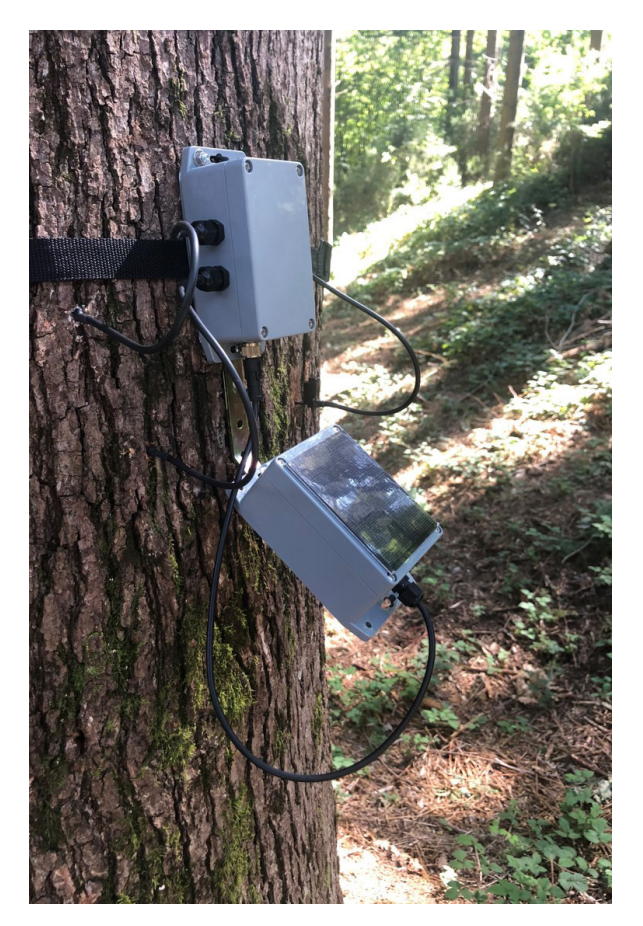
Figure 1 - Tree-Talker installed for the monitoring of a tree and its power unit (battery case with photovoltaic panel).

The sapflow density is retrieved according to the Heat Balance Method (Granier 1985) by monitoring the temperature of two 20 mm long probes inserted into the stem wood at 10 cm distance along the trunk vertical axis. The probe in the higher position is heated while the lower one provides the stem wood reference temperature and is additionally equipped with a capacitive sensor for wood moisture measurements. A similar technology is used in a dedicated probe for SWC and temperature measurements. Multispectral measurements of sunlight are performed across 12 bands covering the visible and near infra-red spectra and centred at the wavelengths of 450, 500, 550, 570, 600, 610, 650, 680, 730, 760, 810 and 860 nm (full-width half-max of 40nm) by means of a spectrometer with a field of view of 40° mounted on top of the TT case. Stem radial